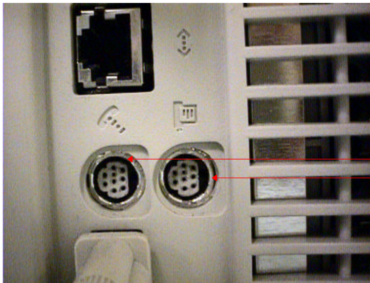
Diagram for Connecting the Ricoh Digital Cameras to Mac Computer